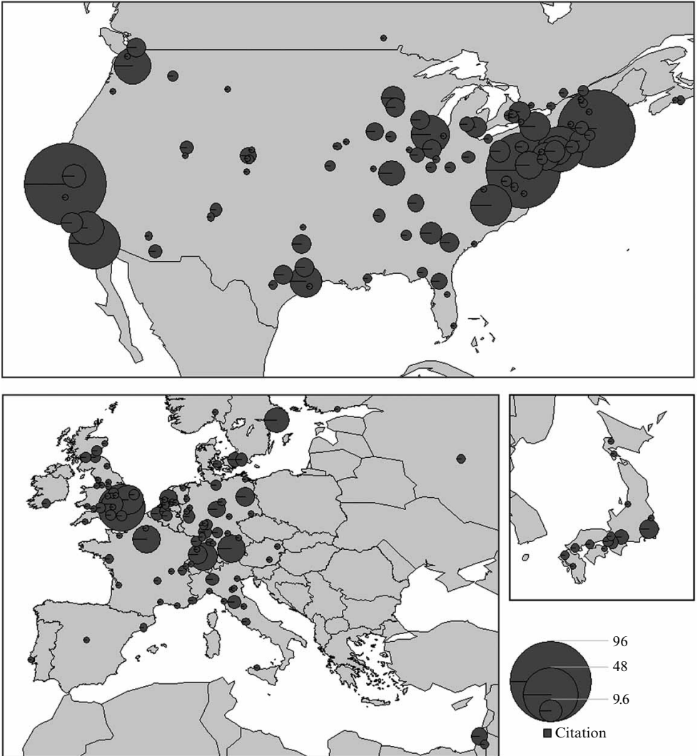
Figure 2. The geographical distribution of the highly cited.

from the ISI data. The correlation in the United Kingdom with The Times newspaper (2002) ranking is much the same at 43%. What this analysis reveals is a pattern of much greater concentration than I originally anticipated from other literature on the geography of the modern economy, notwithstanding the influence of history and the effects of national policy on the location of research centres (Matthiessen and Schwarz, 1999).