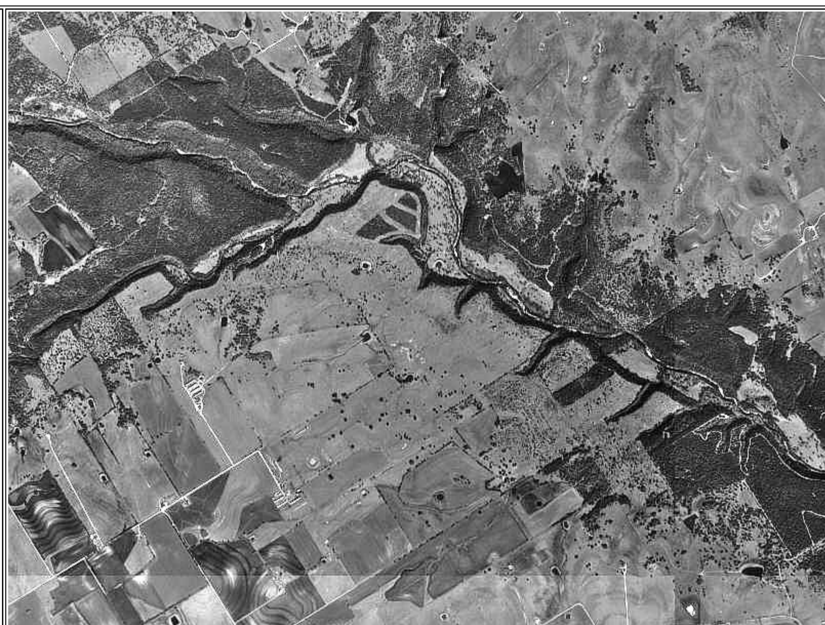
Bush Ranch near Crawford, TX, 19 Jan 1995