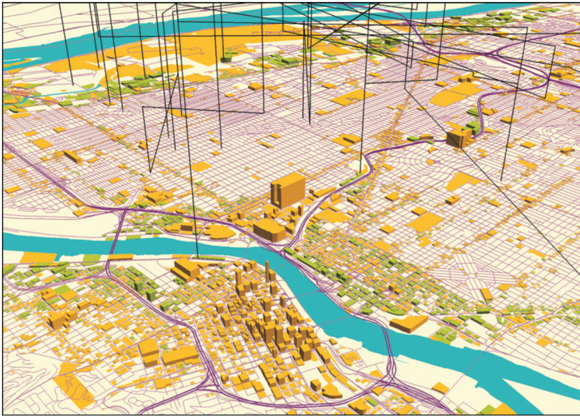
Figure 2. A detailed view of an area close to downtown Portland, Oregon.

1999b). Based on locational proximity to a single reference point (e.g., home or the workplace), these measures ignore the sequential unfolding of women's daily lives in space and time and the restrictive effect of fixity constraint on their access to urban opportunities in a particular day. Instead of using conventional measures, I formulate three space-time accessibility measures that take these factors into account. I develop a geocomputational algorithm to implement these measures in a GIS environment. It uses the activity diary data I collected from a sample of individuals in Columbus, Ohio and a geographic database with parcel-level details. The results from using space-time measures reveal considerable spatial variations in women's accessibility patterns, while men's accessibility patterns mainly follow the spatial distribution of the urban opportunities in the study area. The results from using conventional measures, however, do not indicate this kind of gender difference in accessibility patterns. The study concludes that GIS-based space-time measures are more sensitive to women's life-situations when compared to conventional measures, and that conventional accessibility measures suffer from an inherent gender bias and therefore are not suitable for studying women's accessibility.